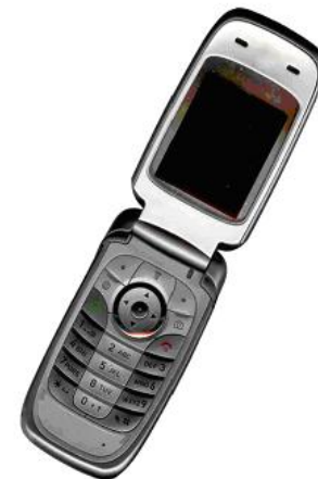
Fig. 3. Example of an image with acceptable resolution.