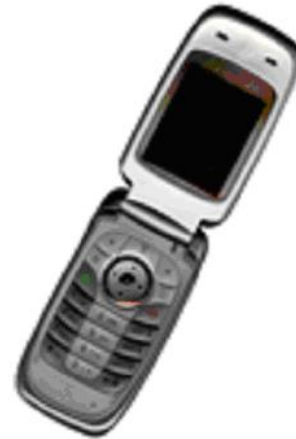
Fig. 2. Example of an unacceptable low-resolution image.