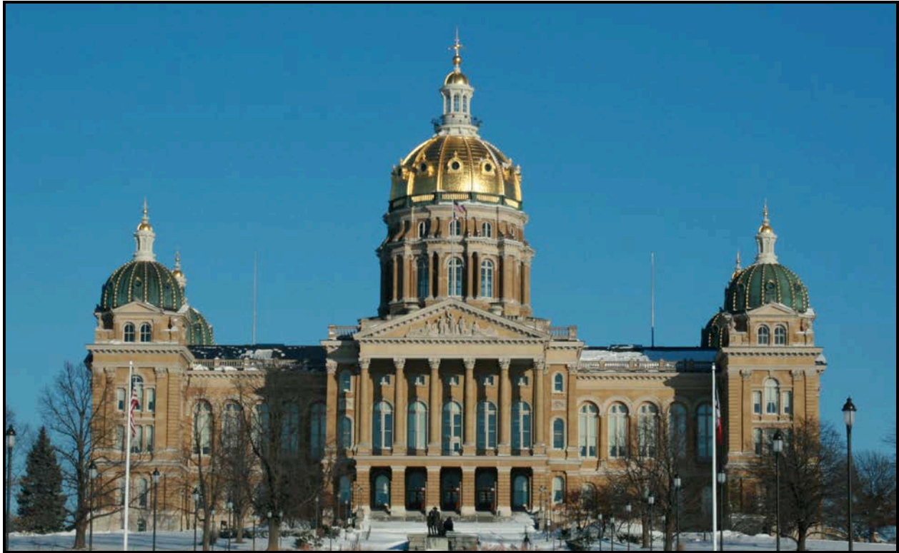
State Capitol Building, Des Moines, Iowa.