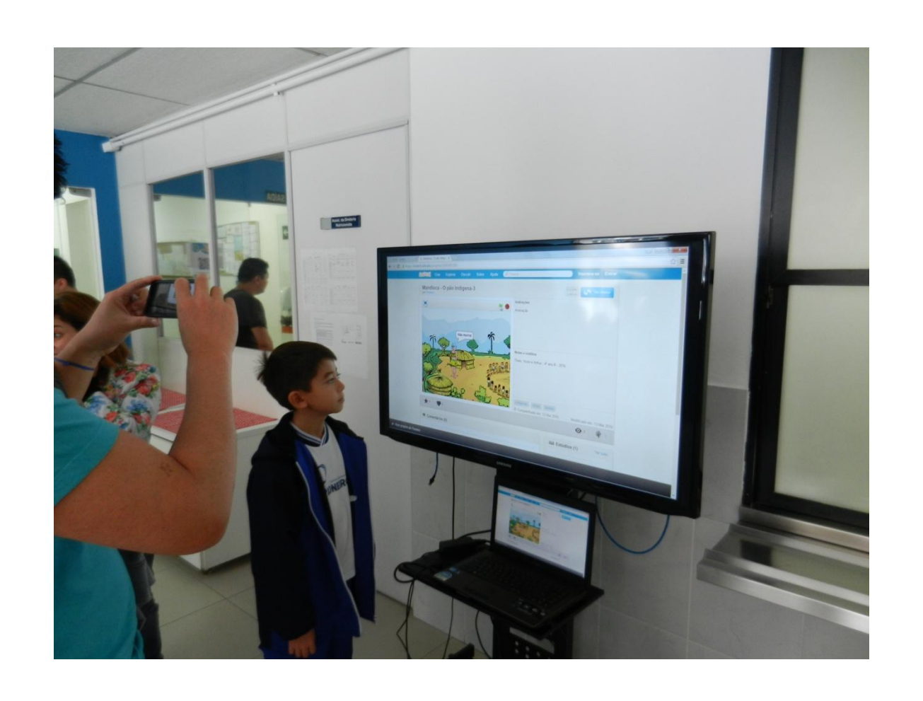
Objects can be moved around