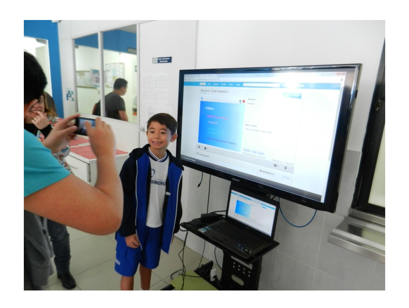
Take a picture – you have done it!