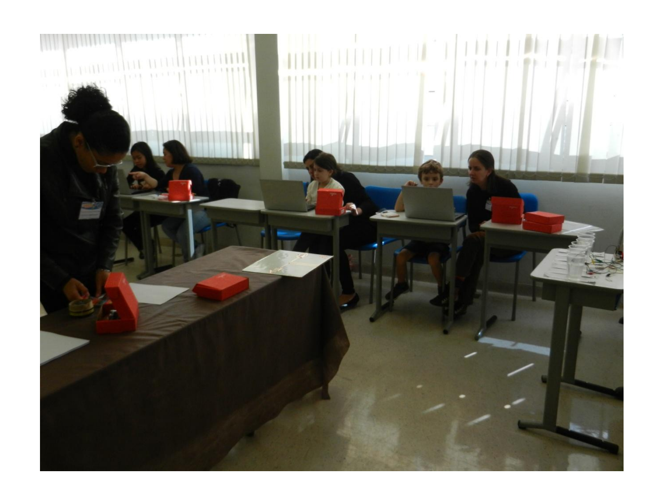
More of computer class-play room