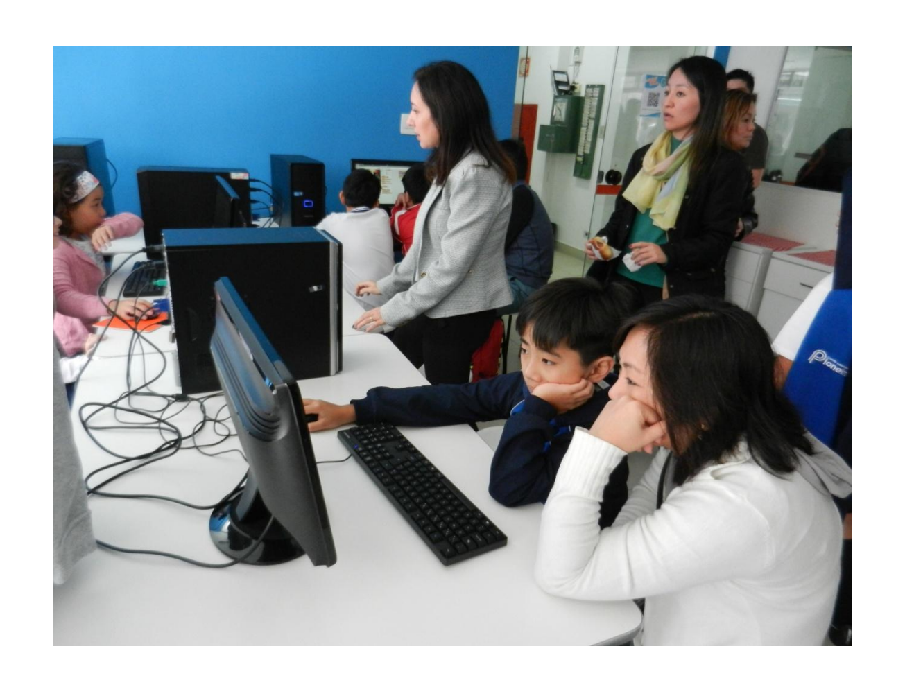
Soon it is realized that rapt attention yields results