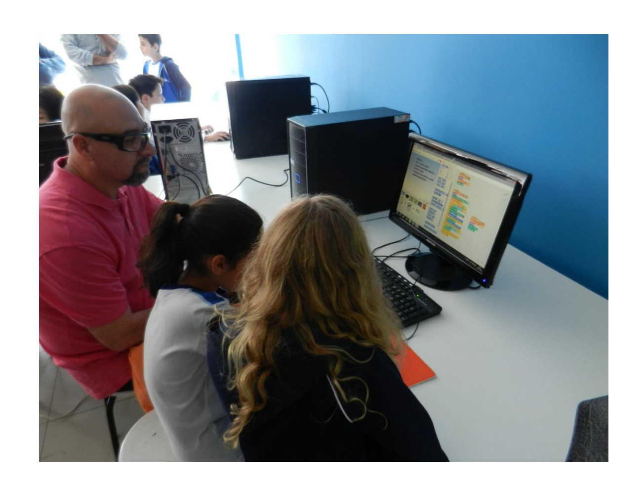
Yes, give them an early start