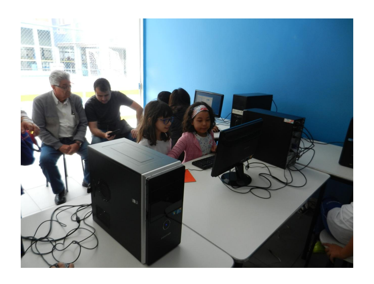
Little ones busy at the their computer terminals