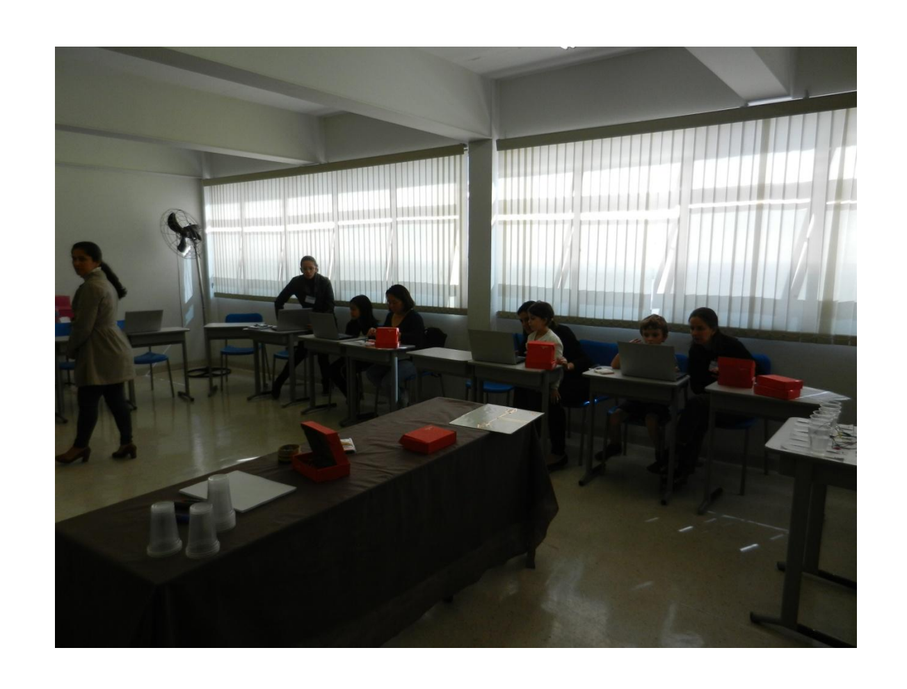
A typical computer class-play room at Pioneira