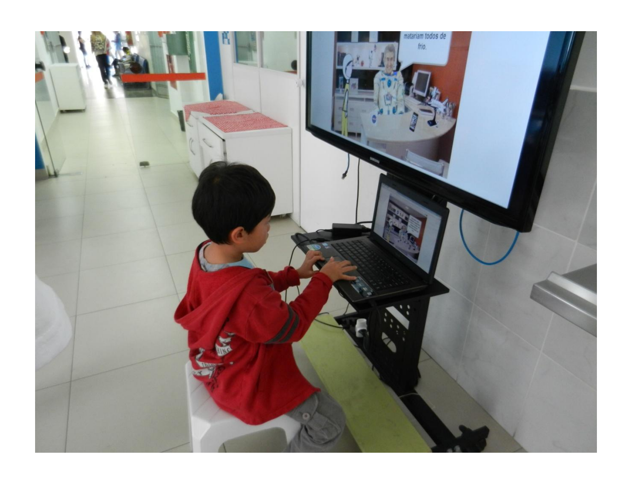
Wow – computer programming made easy