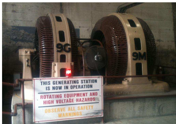
Motor-Generator Frequency Converter at the Mechanicville Hydroelectric Station, 2013.